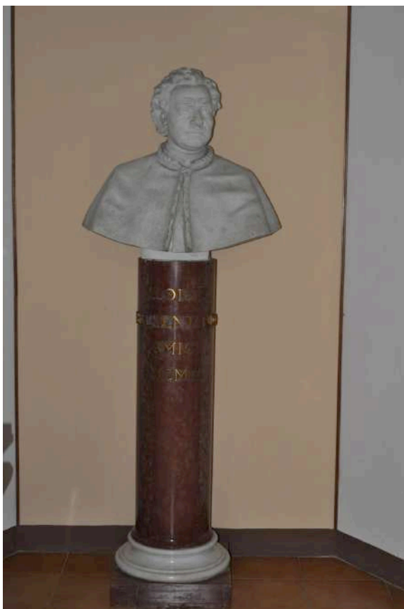
Figure 7: Canon Luigi Breventani's bust