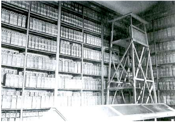
Figure 3: Hall in the second seat of the archive with wooden shelves

Between 1818 and 1826 the halls on the upper floor in the southern wing of the archiepiscopal palace, which previously had been the seat of the College of the Doctors (where the students of the University of Bologna graduated: Alma Mater is known as the world's most ancient University), were readapted as archival deposits. High wooden shelves were leant against the walls; they were six meters high and one meter deep, and they were filled with a great deal of documents ( Figure 3 ).