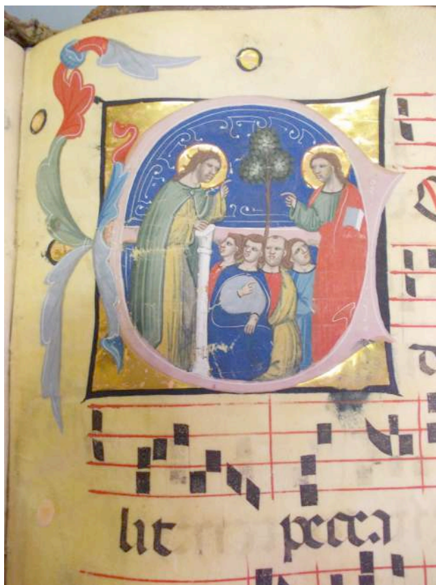
Figure 10: Miniated initial letter “E” (Ecce Agnus Dei)