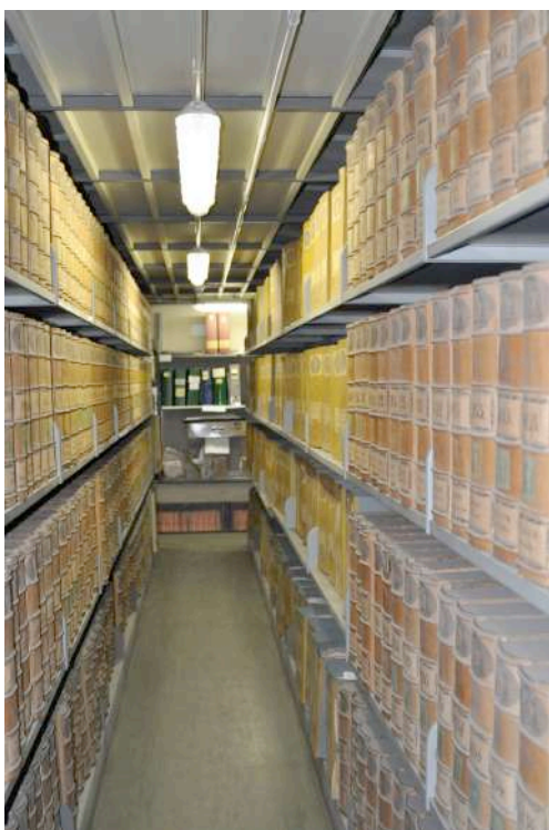
Figure 8: Corridor from the tower deposit in the third seat

The transfer of the funds, in Summer 1961, was the prelude to the inauguration (October 5th) of the today's seat of the Archivio Arcivescovile and to the new opening to the public starting from the month of February of the following year ( Figure 9 ).