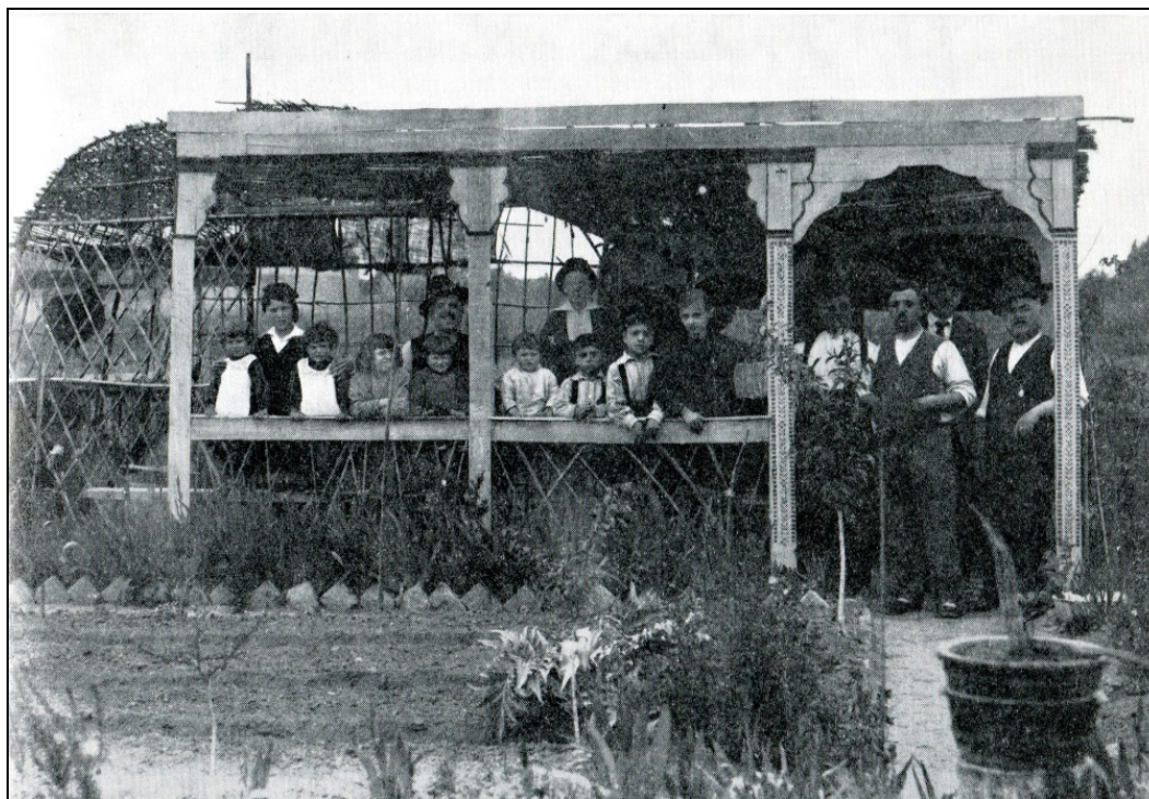
Figure 9: Small hut for the refreshment of the pilgrims at the end of the Bregoli near the Sanctuary.