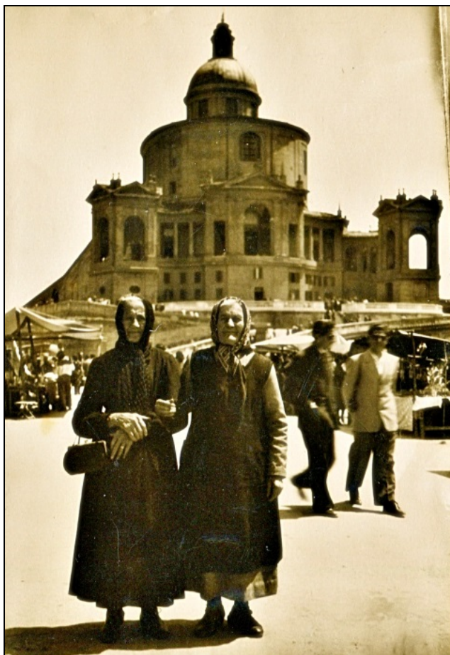
Figure 4: Old women climbs on foot, in the 30s, on the Colle della Guardia to pray to the Blessed Virgin.