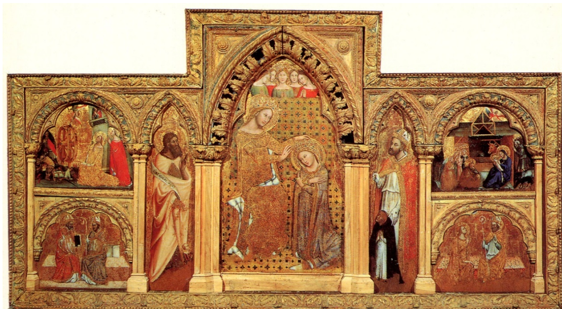
Figure 7: Vitale da Bologna: “L’Incoronazione della Vergine”, table commissioned by the Canonici Renani for their Church of the Canonica di Casalecchio and now kept in Bologna in the transept of the S.S. Salvatore. Among the characters painted there is also S. Thomas Becket, archbishop of Canterbury (1117 - 1170), who entrusted to the Renans the English students who attended the University of Bologna