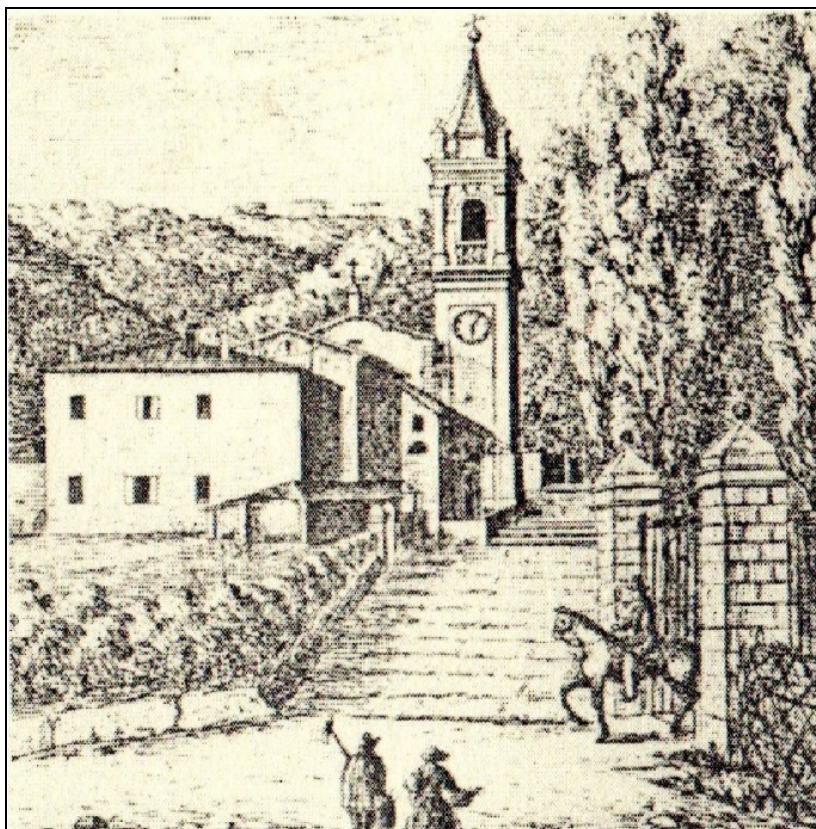
Figure 5: Ancient image of the Church of San Martino in Casalecchio as it was in an engraving by Corty dated 1849. Next to the sacred building is the beginning of the Sentiero dei Bregoli, on the right the gate of the Marchesi Sampieri estate where, in a farm model, administered by British agronomists, there were two villas with an Italian garden and a magnificent English park