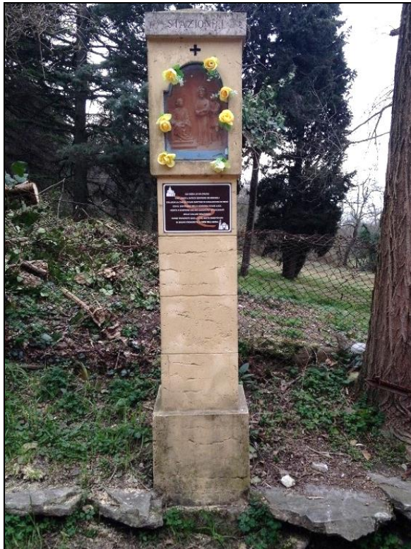
Figure 13: Votive shrine of the first station of the Via Crucis.

privatisation of the road, the Committee also superseded the restoration of the Via Crucis, the pillars of which were still damaged by the war ( Figures 13, 14, 15 ).