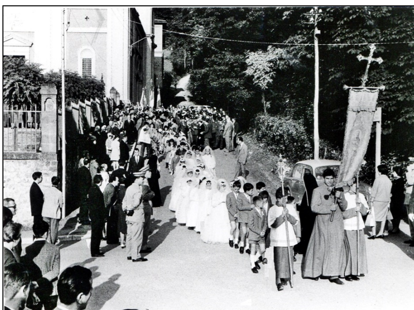
Figure 1: Beginning of the Bregoli ascent, and religious procession with the children (the Parish of San Martino mid-50s).

The citizens call it “Brigoli”, a term with a Mediterranean linguistic root, “bric”, indicating arduous and stony places, as we can see in Provençal, some dialects of northern Italy and ancient Italian words. Thus, for a Bolognese, walking along the “Brigoli” would feel like a bit of an adventure ( Figure 1 ).