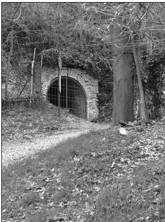
Figure 10: Ettore Muti refuge entrance.

In 1940, at the outbreak of the Second World War, the Municipality of Casalecchio devised a detailed plan concerning air-raid shelters to protect the local population. The most important one was excavated in the mountain, along the flanks of the Bregoli path, between the first and the second curve. The horse-shoe-shaped shelter - ample, with a double exit and equipped with an electrical system was quite safe, at least to provide a protection against the weapons used at the time. The Municipality dedicated it to Ettore Muti, one of the most complex and controversial personalities of those years – not to be confused with the crimes committed in his name after his death ( Figure 10 ).