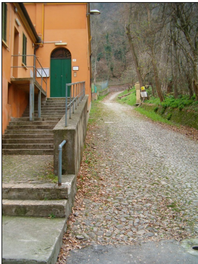
Figure 2: The beginning of the Bregoli trail (Casalecchio di Reno, 2017).

The existence of this path was made official in the maps of the Pontifical Land Registry of 1780, although evidence is also provided by maps, documents and land registries of earlier times. From the Middle Age on, the Bregoli was the obvious route for all pilgrims heading to the Sanctuary of the Beata Vergine di San Luca from the valleys of the Reno river, as well as from the Lavino or Samoggia valleys ( Figure 2 ).