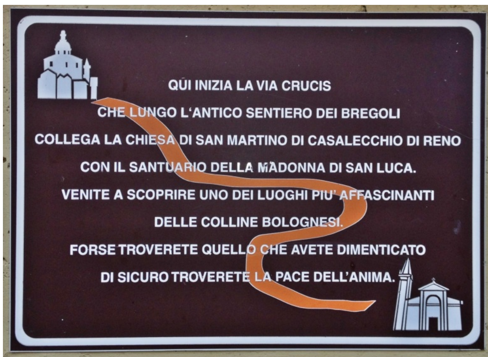
Figure 14: Detail of the plaque affixed to the first votive shrine.