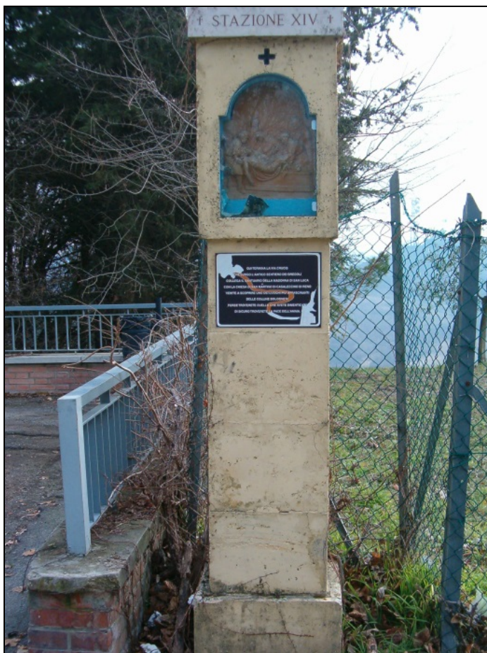
Figure 15: Votive shrine of the XIV and last station of the Holy Way of the Cross