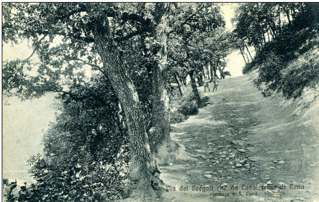
Figure 8: The path at the beginning of the last century.