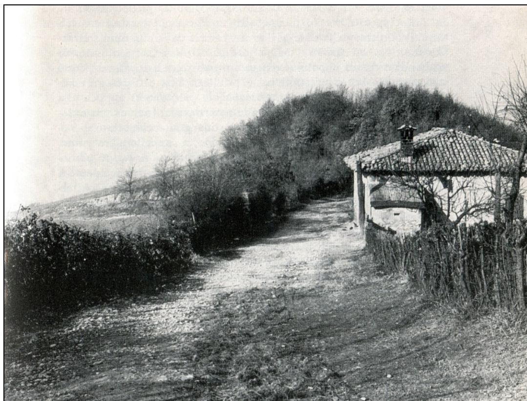
Figure 12: The rustic home at the top of the Bregoli path now transformed into a villa

In 1983, the owner of a farmhouse located at the border between the Bregoli and the driveable road Via Montalbano (taking to the Sanctuary of Holy Virgin) was granted by the municipality of Bologna the permission to restore the building, which was turned into an elegant villa ( Figure 12 ).