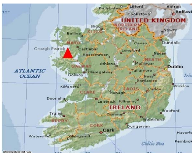
Figure 1: The Location of Croagh Patrick on the Map of the Island of Ireland

Croagh Patrick is Ireland's 800 years old sacred heritage of international repute. It is traditionally known as Ireland's holiest mountain, and an internationally recognised destination for pilgrimage and religious observance for decades. Thus, has been dubbed the Reek. (which is normally the last Sunday in July and the main pilgrimage day). It is equally one of Ireland's most visited touristic attraction. Thus, it serves a dual purpose, simultaneously serving as a place of pilgrimage and tourism. This historic landmark is situated near the town of Westport. This century old mountain is approximately 764m above the sea levels, and it's about 8 km from the city of Westport, 92 km from Galway city and 230 km from the Dublin city centre. It sits above the cities of Murrisk and Lecanvey. The holy mountain boasts of over 1 million visitors who climb it annually. However, these numbers skyrocket especially during the reek Sunday, with visitor numbers reaching a threshold of 25.000. However, it is the increasingly deteriorating conditions of the mountain that led to the formation of a stakeholder group aimed at managing the visitor's experience and impacts, while conserving the sacred natural heritage for future generation consumption.