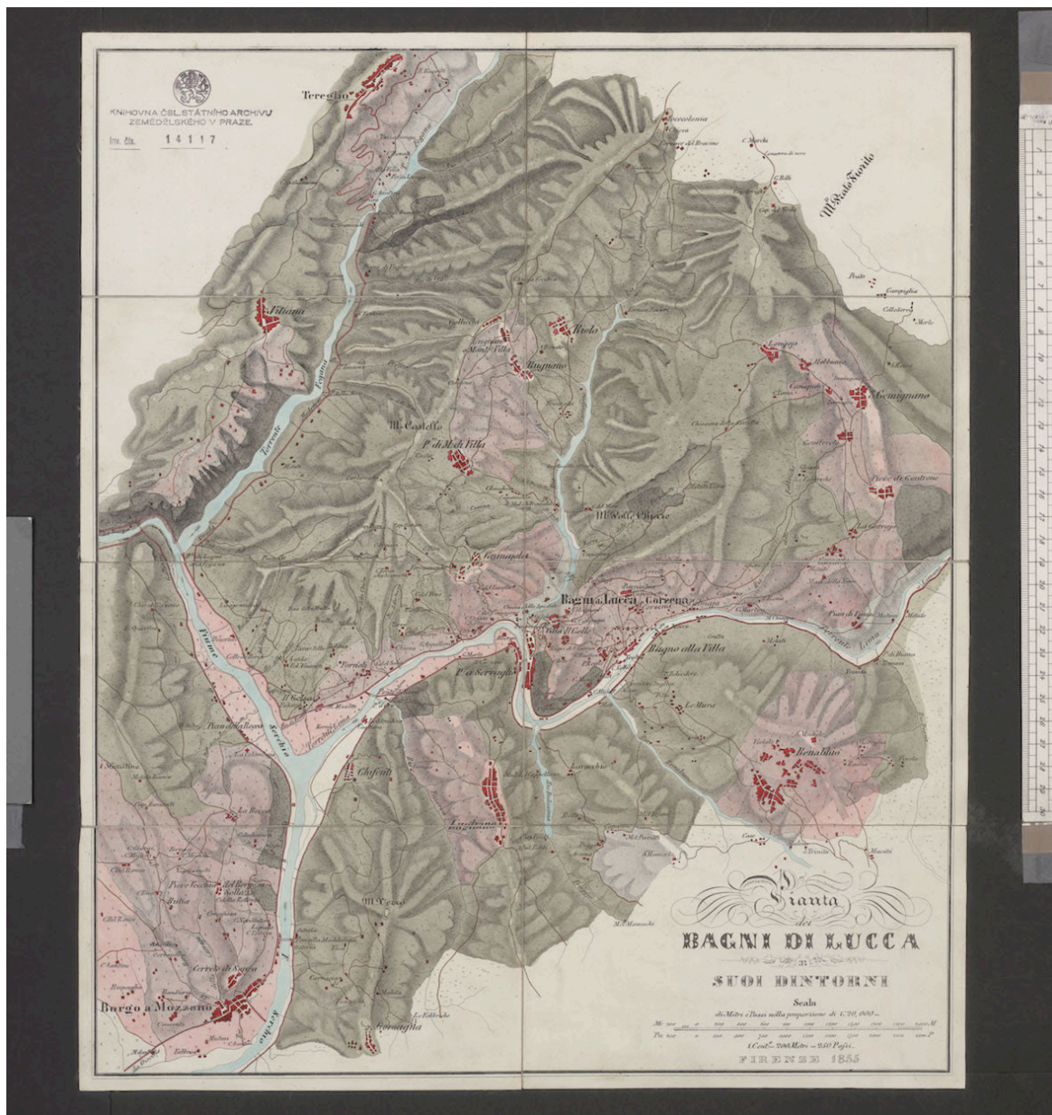
Figure 7: Map of Bagni di Lucca and its surroundings, Military Topographical Office, (1855-56)