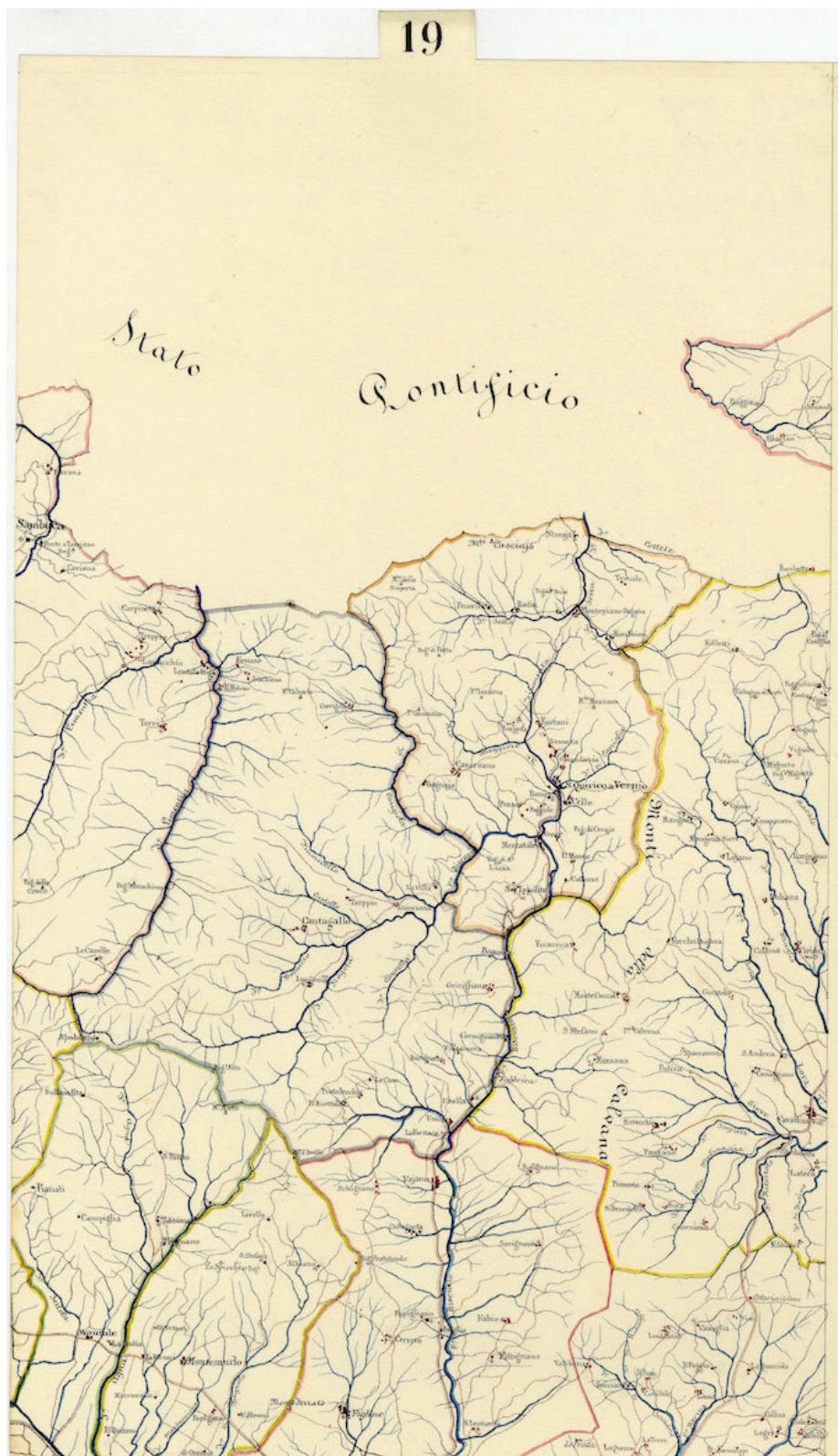
Figure 5: Detail of the Tuscany handwritten map in scale 1:100,000, Giovanni Inghirami, 1835-40, folio 19