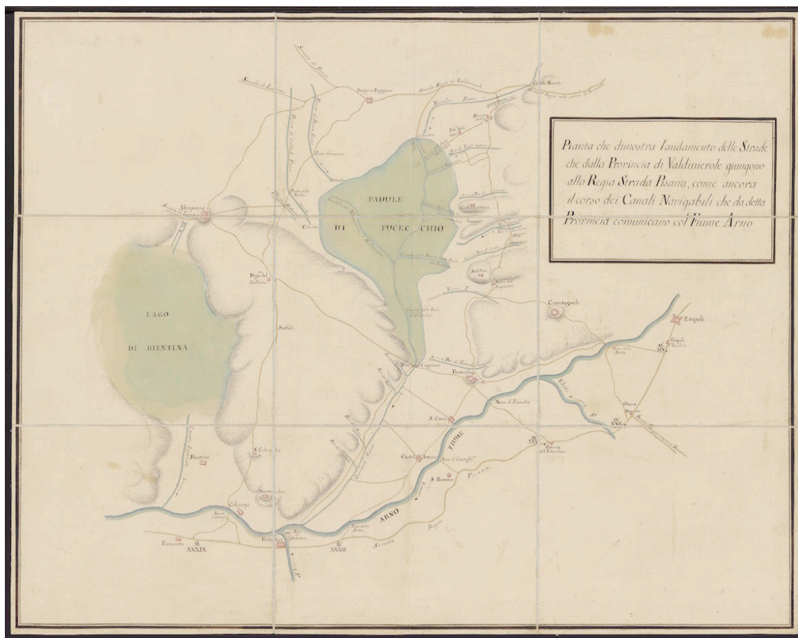
Figure 8: Canals and roads between Valdinievole and Valdarno di Sotto, handwritten from the second half of the 18th century