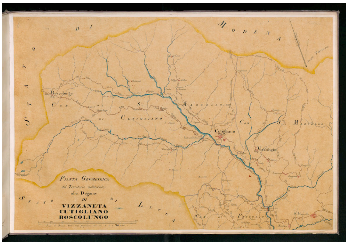
Figure 6: Map of the Pistoia Mountain with the Modena road or Ximenes-Giardini from Abetone to San Marcello, handwritten about 1830