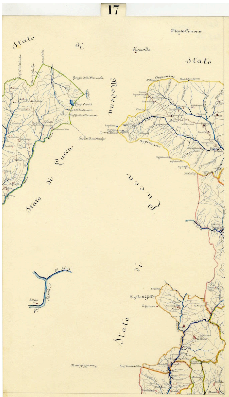
Figure 3: Detail of the Tuscany handwritten map in scale 1:100,000, Giovanni Inghirami, 1835-40, folio 17