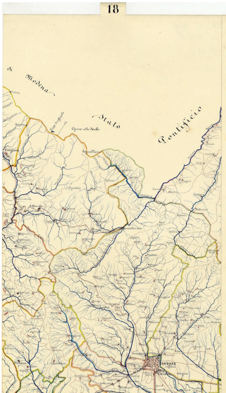
Figure 4: Detail of the Tuscany handwritten map in scale 1:100,000, Giovanni Inghirami, 1835-40, folio 18