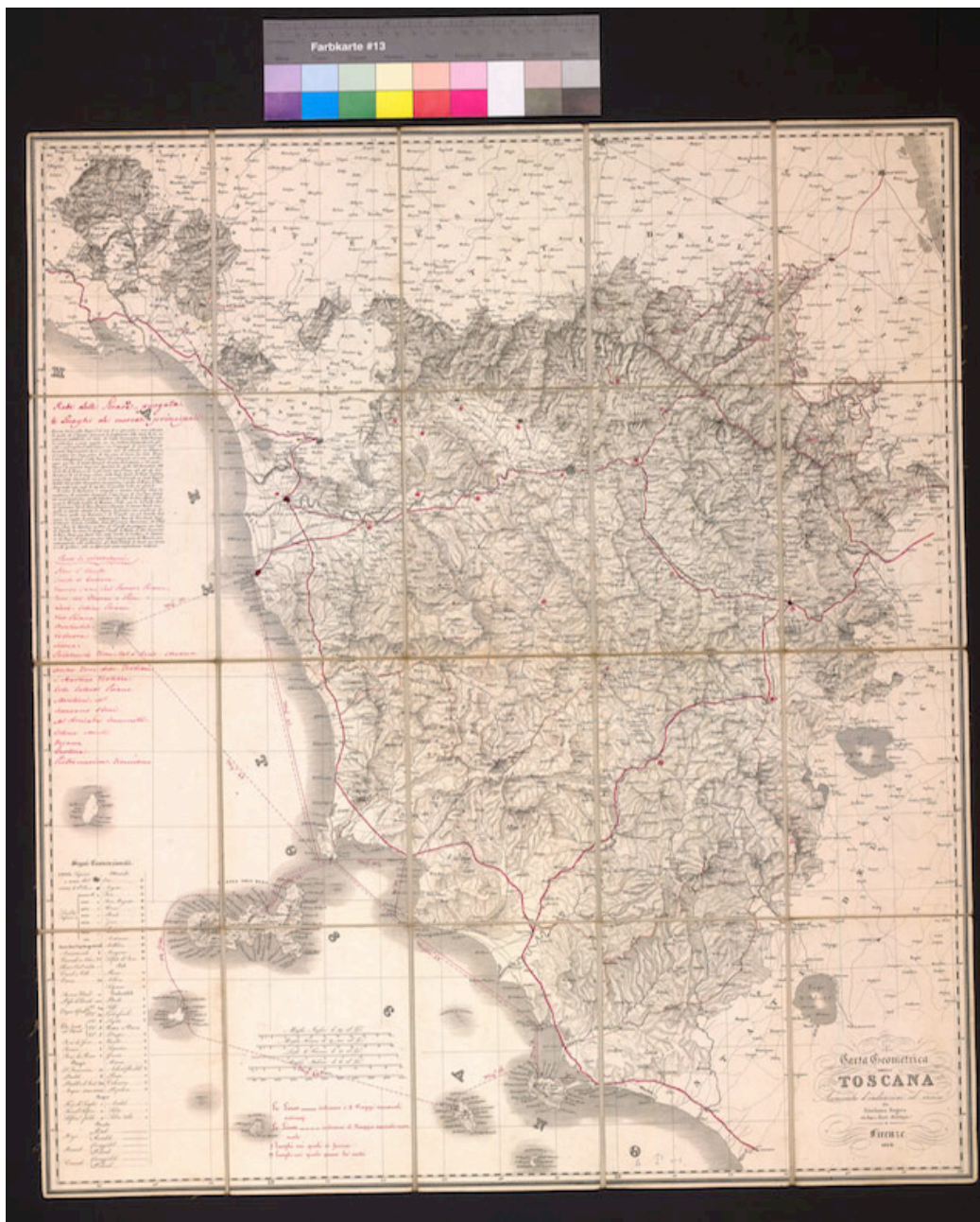
Figure 1: Map of Tuscany with road network, Girolamo Segato, 1832.