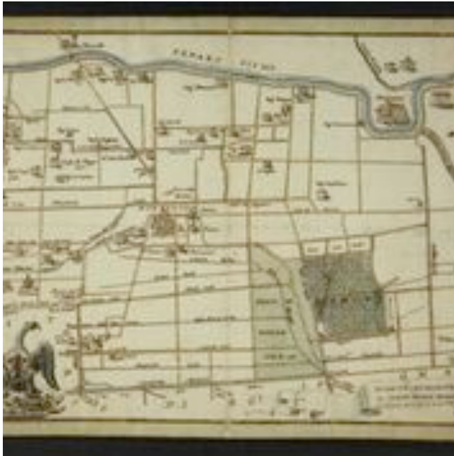
Figure 2: The Modenese plain around the castle and the abbey of Nonantola, with its large forest of the early Middle Ages and the Via Mavora ( Maior ) leading to the Via Emilia: eighteenth-century drawing

design depicts settlements and cultivations of the territory up to Bolognese and in its technical perfection and aesthetic pleasure shows that it was traced in the eighteenth century. The technique is in ink and watercolors. Thanks to this depiction, we see that for Nonantola passes the "Via Mavora", the Via Maggiore of the territory between Bologna and Modena, still recognizable in the eighteenth century, before the great nineteenth-century transformations of viability, methods of cultivation, subdivisions 15 .