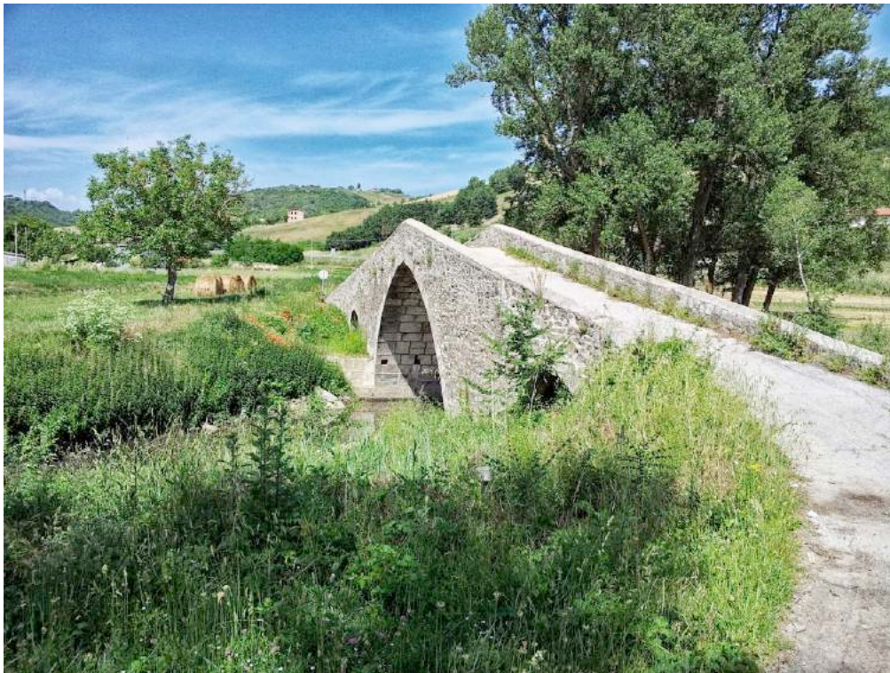
Figure 9: Tratturo Castel di Sangro – Lucera, “Toro Bridge”, Toro (CB)