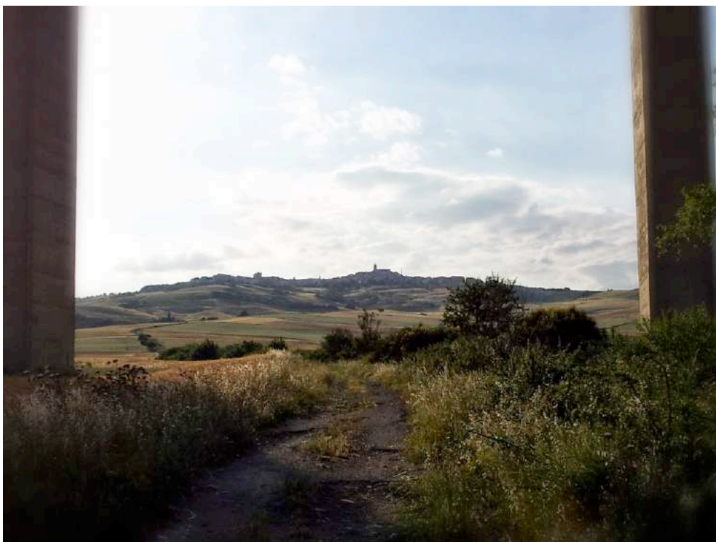
Figure 10: Tratturo Castel di Sangro – Lucera, Motta Montecorvino landscape (FG)