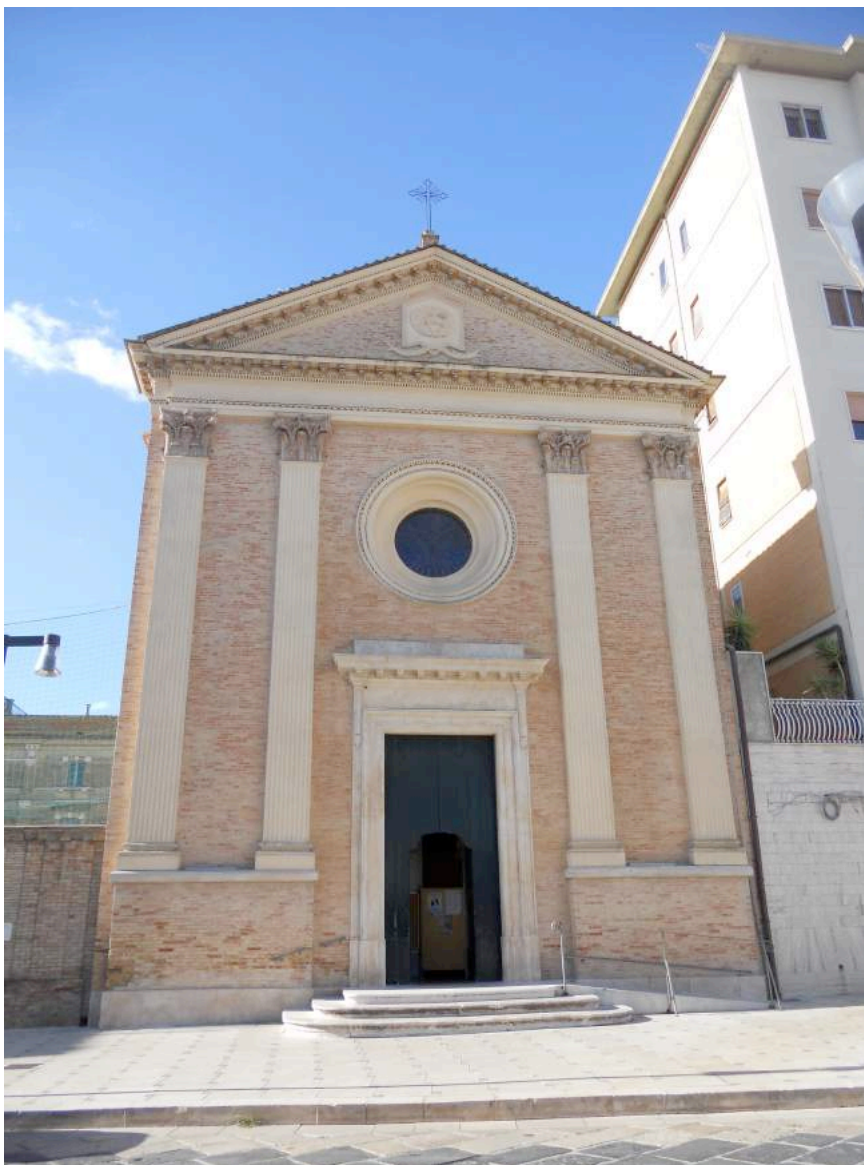
Figure 6: San Giacomo Church, Lucera (FG)