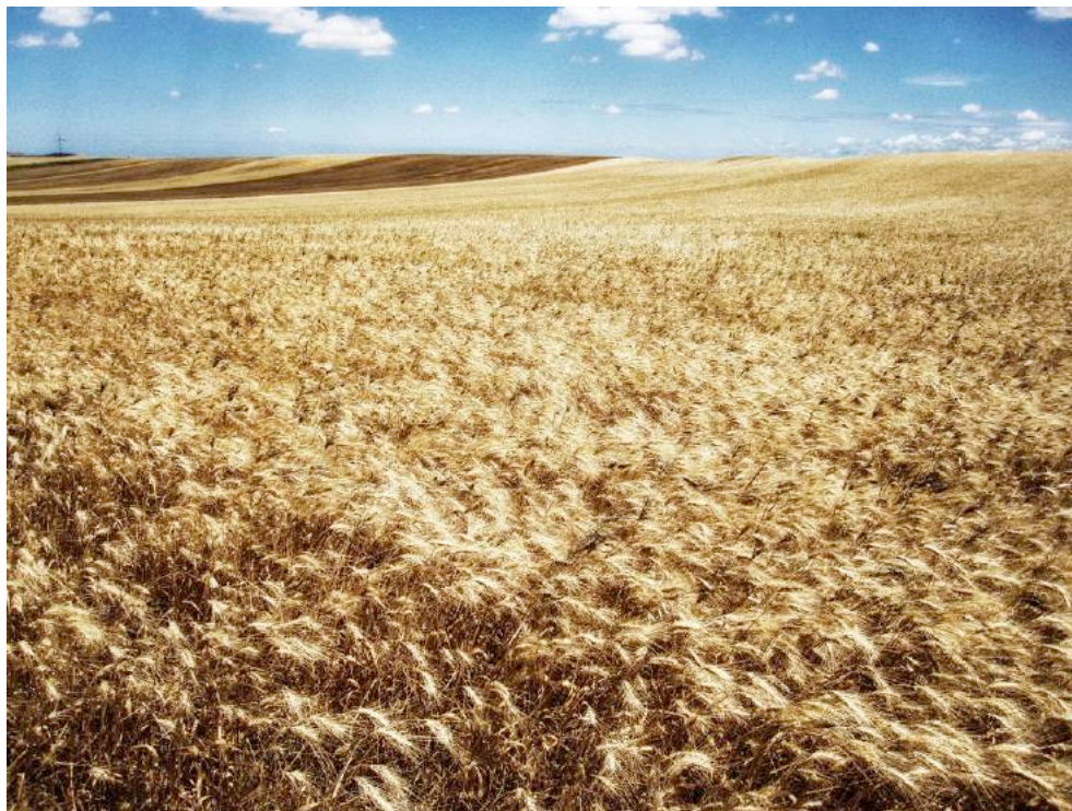
Figure 11: Tratturo Castel di Sangro – Lucera, Tavoliere delle Puglie landscape, Lucera (FG)