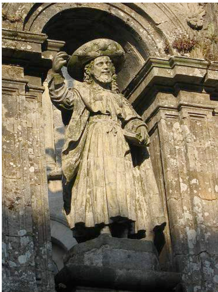
Figure 1: Statue of San Giacomo Pellegrino, Santiago de Compostela Cathedral

The Galician saint was represented mainly in three ways: as an Apostle, as a pilgrim and as Miles Christi . The latter image, known as Santiago Matamoros (literally “killer of Moors”), found its highest expression particularly in Spain, while the others were common in all countries (Bango Torviso, 1993). The image of Saint James as a pilgrim was surely among the most known and portrayed, since his attributes referring to the pilgrims and pilgrimages were iconic; on the other hand, the symbol that most strongly permeated the veneration of Saint James was the popular concha or shell, quintessential signum Peregrinationis of the Camino de Santiago (Caucci Von Saucken J., 2010) (fig. n.1).