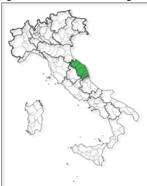
Figure 2: Location of Marche Region in Italy