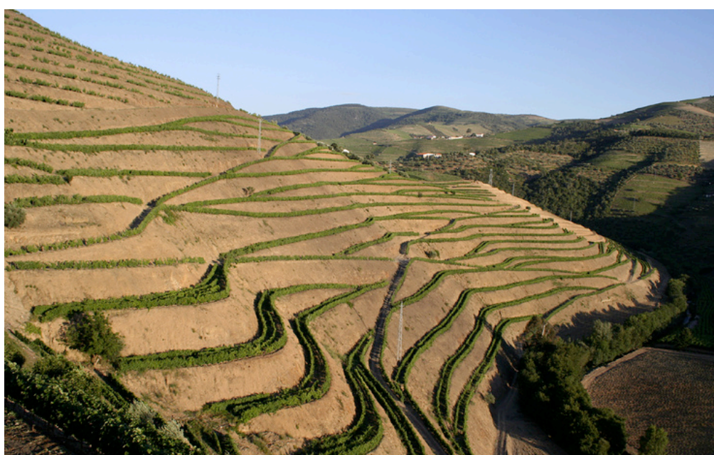
Fig.6 Quinta da Perdiz: new patamares