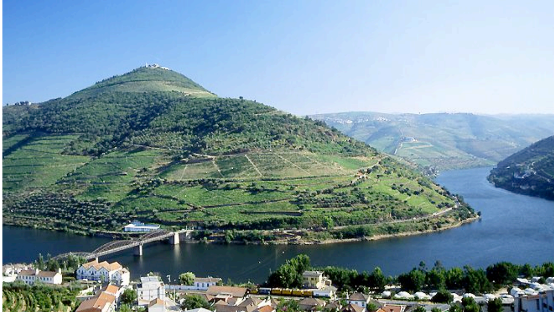
Fig.5 Cruises on the Douro River