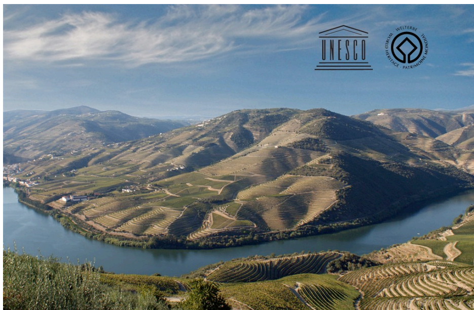
Fig. 3 The UNESCO Valley of Douro