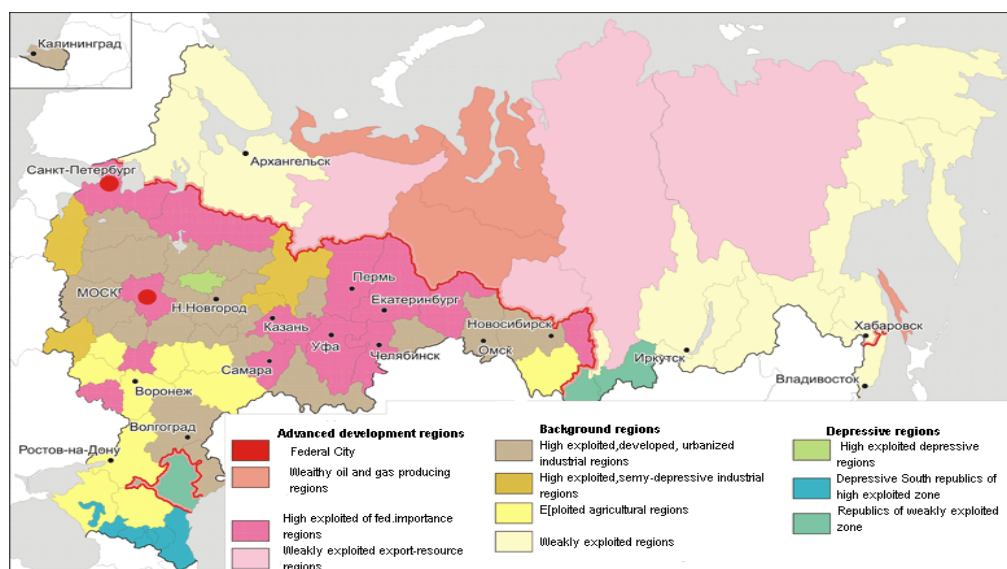
Figure 1. The types of regions development in Russia

As a result the following types of regions development were identified on the space of Russia (Figure 1).