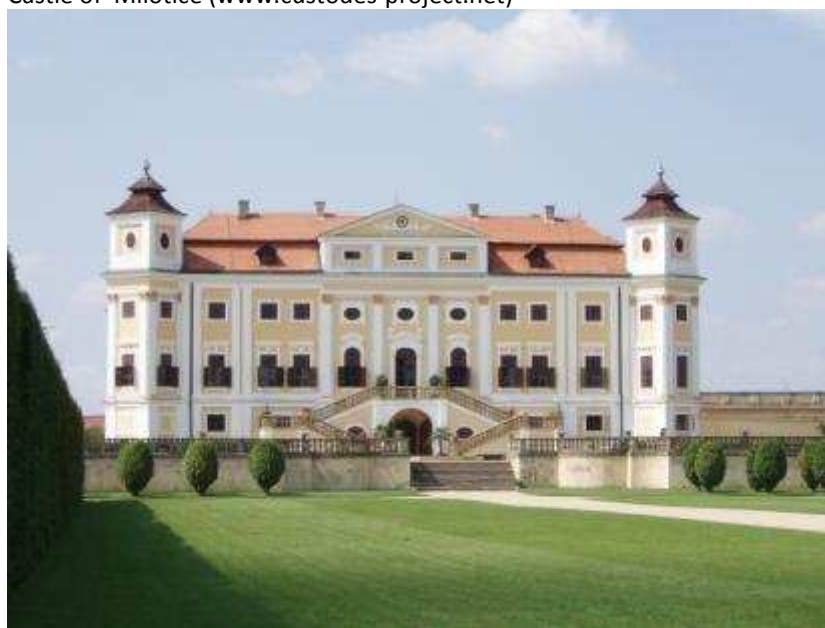
Castle of Milotice

to the area. Various events, such as festivals and fairs, take place throughout the year and give a great opportunity to encounter traditional folk art. The most famous events include the Festivities of St. Vavřinec (St. Lawrence), the Imperial Feast and the Celebration of Wine in Hodonín, the “Great Moravia” Road Running Race in Mikulčice, the Spring Music Festival in Dolní Bojanovice, and the International Folklore Festival in Strážnice.