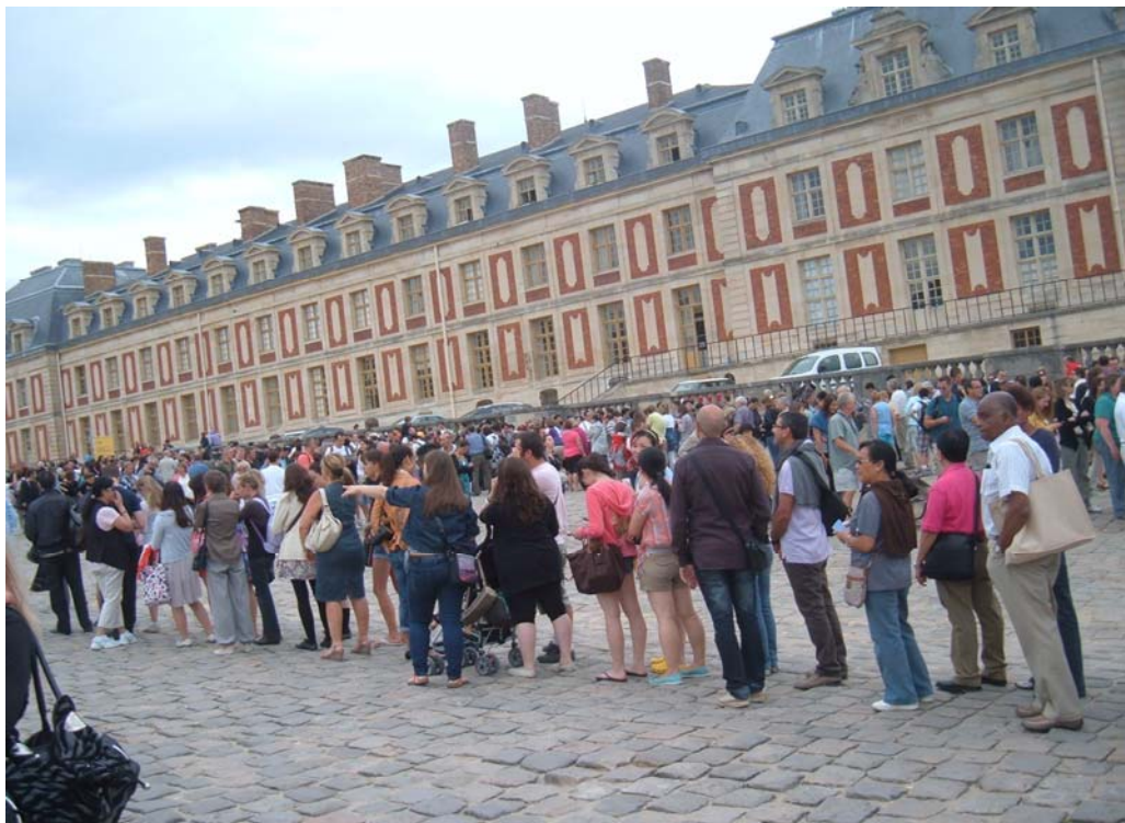
Pict. 2: Two hours to enter the palace of Versailles