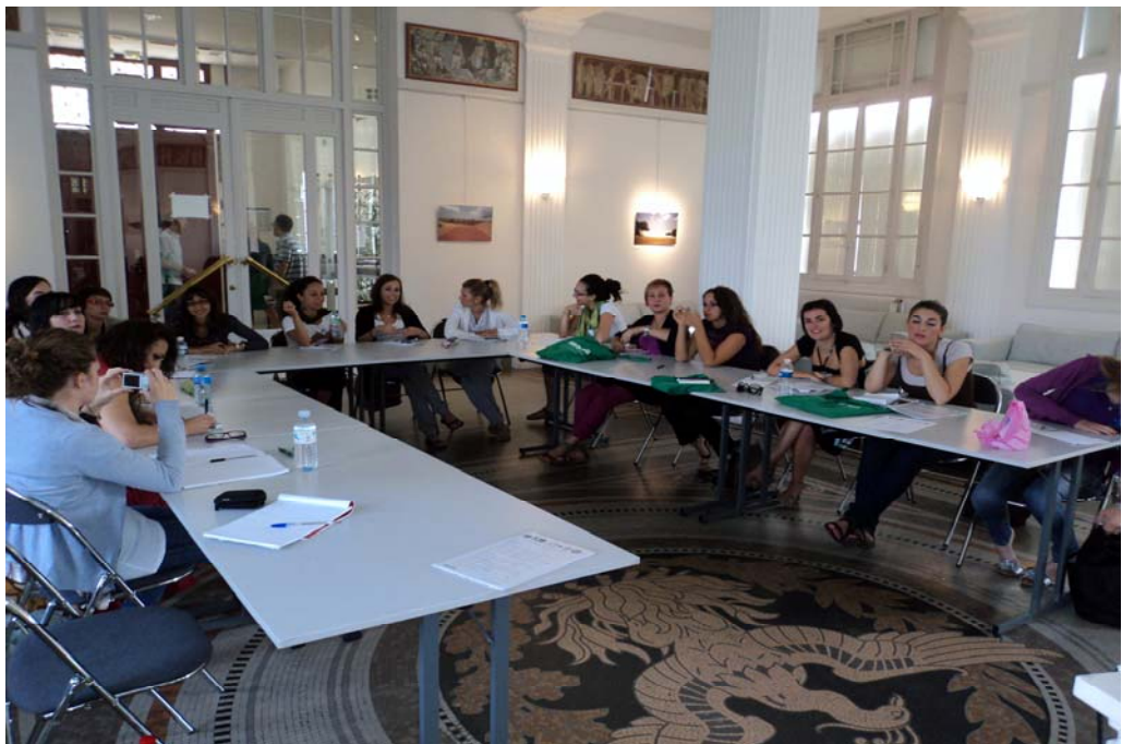
Pict. 5: The Fondation Hellenic in the Cité Universitaire (Paris)