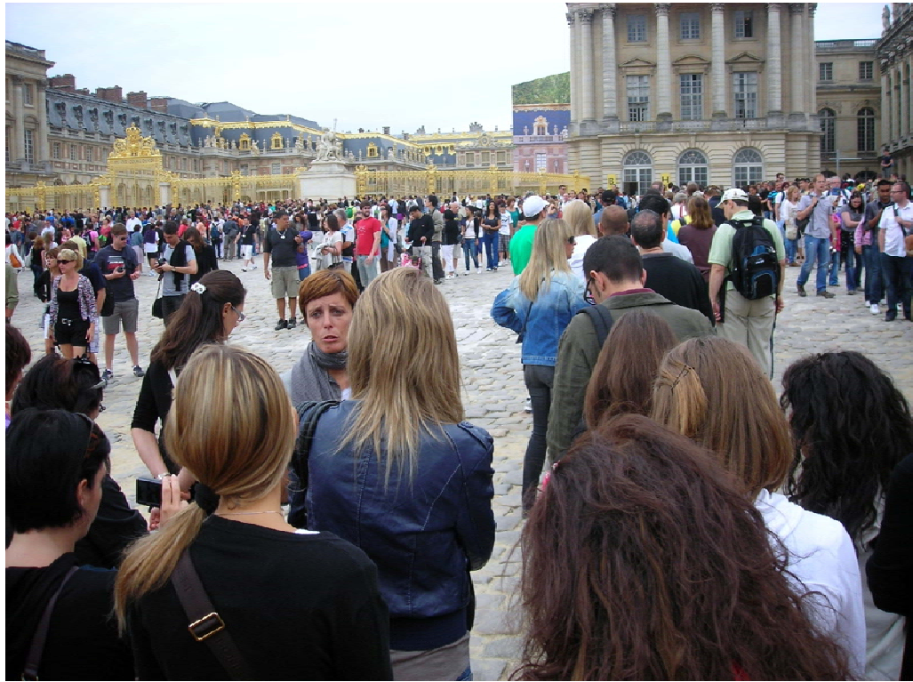
Pict. 1: While waiting to enter the palace of Versailles.