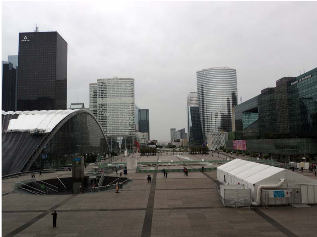
Pict. 8: The Defense (Paris)