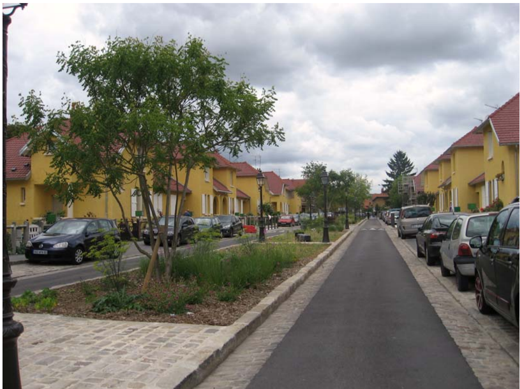
Pict. 7: The garden city of Stains (Saint Denis, Paris)