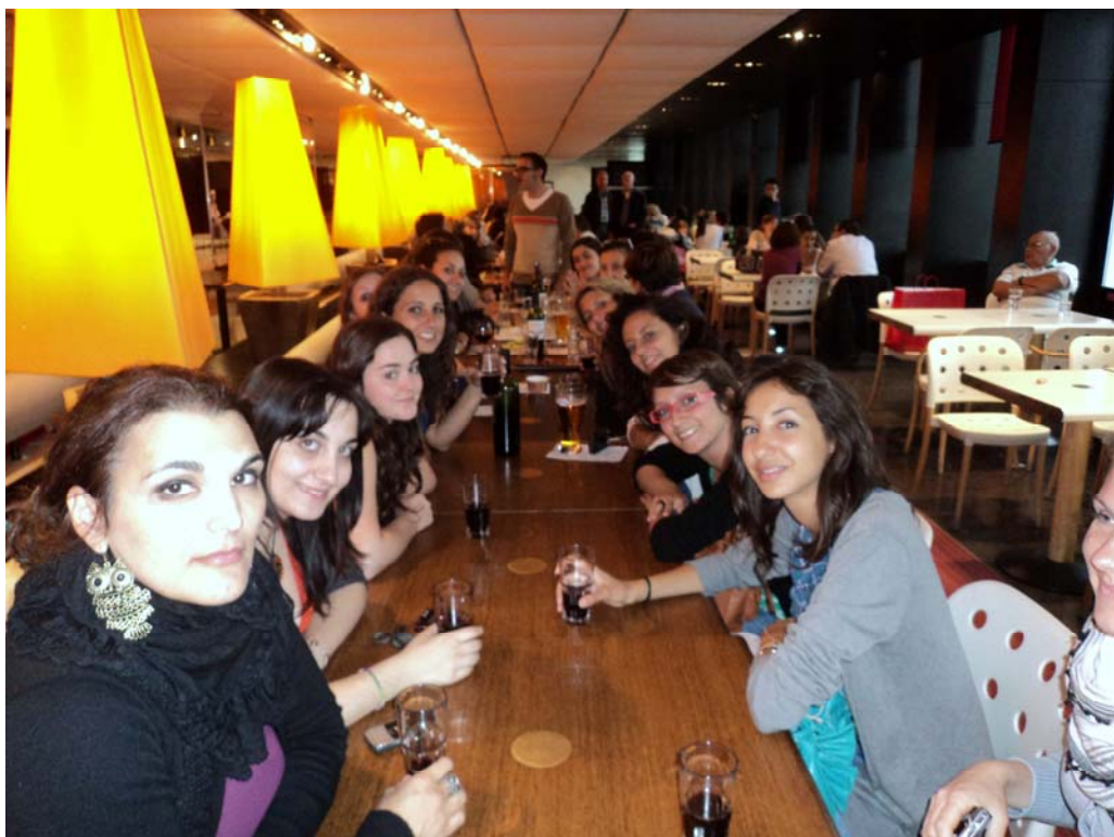
Pict. 9: Together at the restaurant (Paris)