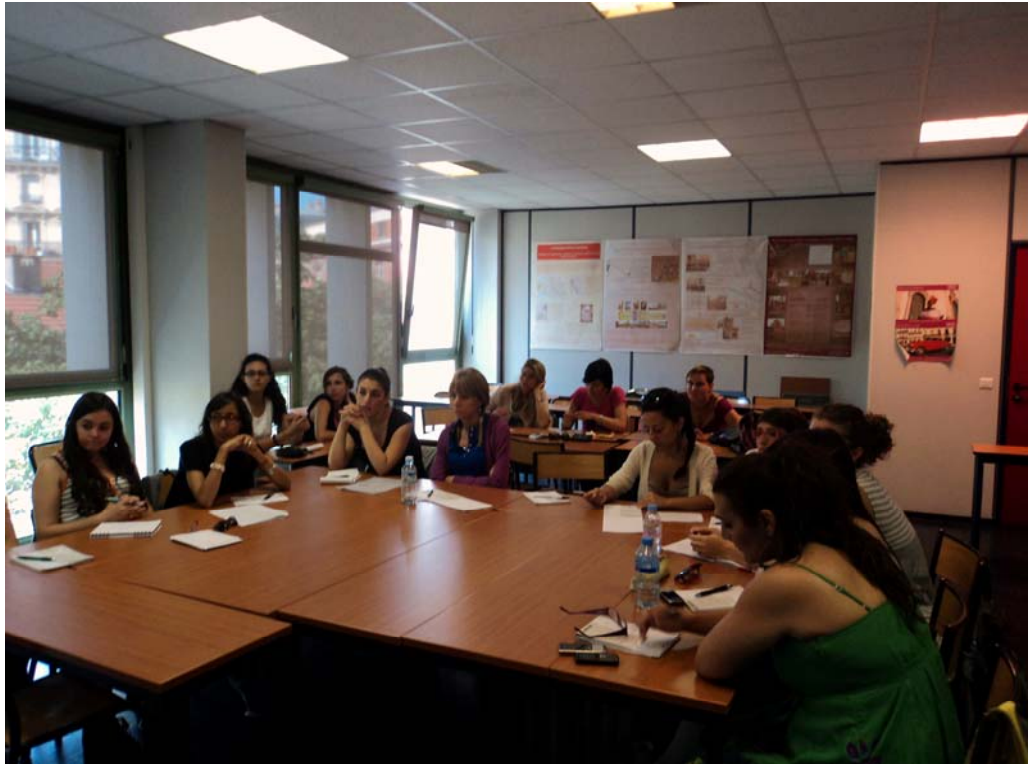
Pict. 6: IREST (Paris1, Panthéon-Sorbonne)