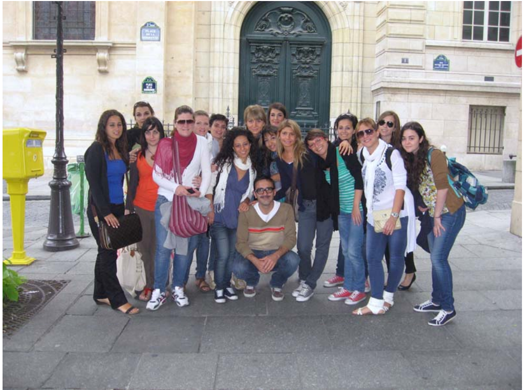
Pict. 10: Together in Rimini