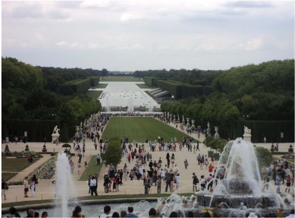
Pict. 4: The garden of Versailles